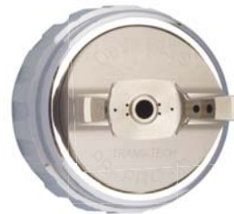
No GP1 High Efficiency Air Cap