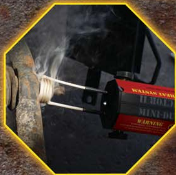
Steering & Suspension