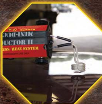
Hail Dent Removal