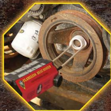
Bearings, Pulleys & Gears