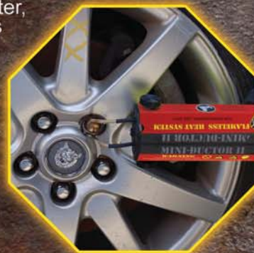
Prevent Expensive Wheel Damage