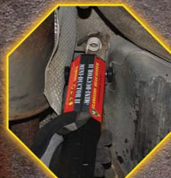
Fuel Tank Straps