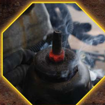
(Overheated to illustrate power)