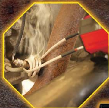
O 2 Sensors

Built in ISO 9000 Facility Patents 6670590, 6563096 Others Pending