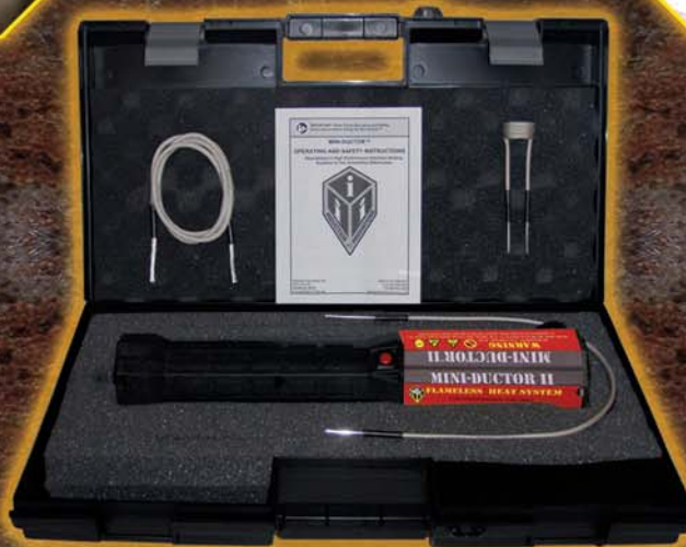
Kit includes Mini-Ductor II Inverter, 3 Basic Attachments, Operators Manual, and Carry Case