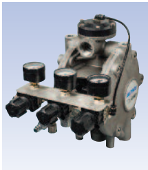
"Built-in" fluid regulator saves money compared with competitive products.

The end cap and air valve cover fixings are unobstructed and can be removed with a single tool, enabling pump maintenance to be performed wherever it is located.