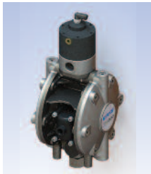
Stainless Steel model with Surge Chamber (for applications where fluid filter will shear fluid). Order DX200SP.