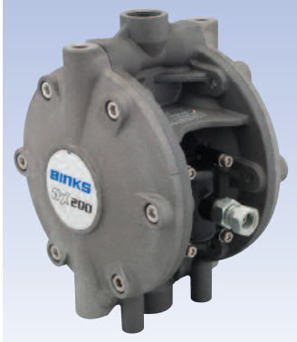
Unregulated DX200 provides users with a vertical fluid outlet.

Pump outfits include a mounting option and are fitted with a flexible suction wand and suction strainer on the vertical bottom inlet. A rigid suction tube is used when pail mounted. The unregulated model has a vertical top outlet, while the fluid regulated model is a front horizontal outlet.