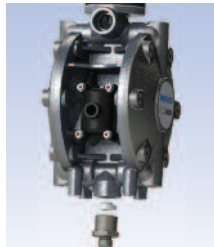
A range of connectors are available to allow connection of the pump inlet/outlet to different system connections.